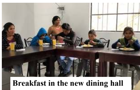
Breakfast in the new dining hall

All of us have sinned and fallen short of GOD's standard, but JESUS Christ came to this earth on a rescue mission to save you, to take your sins on the cross, and to die on your behalf." What a great example of Christ's Love as these wounded military veterans and their wives give their hearts to JESUS!