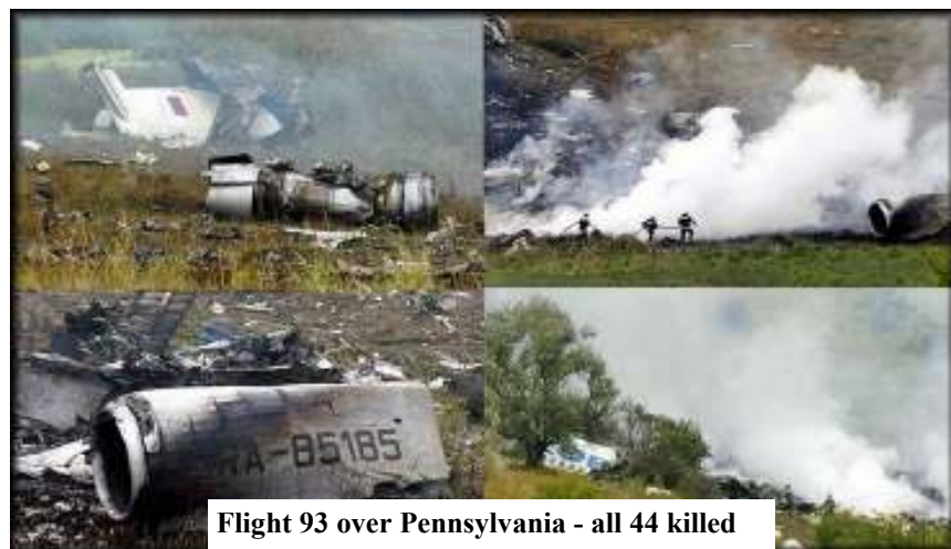
Flight 93 over Pennsylvania - all 44 killed

And then, Beamer and his fellow passengers prayed a prayer that has comforted millions, the prayer that David wrote in a time of great anguish, "The LORD is my Shepherd, I shall not want, He makes me to lie down in green pastures, He leads me beside the still waters, He restores my soul; He leads me in the paths of righteousness for His Name's sake; yea though I walk through the valley of the shadow of death, I will fear no evil, for Thou art with me...Thy rod and Thy staff they comfort me...." And then the famous last words, were uttered by Todd as they ran to the cockpit: "Are you guys ready? LET'S ROLL!"