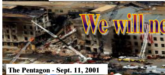
The Pentagon - Sept. 11, 2001