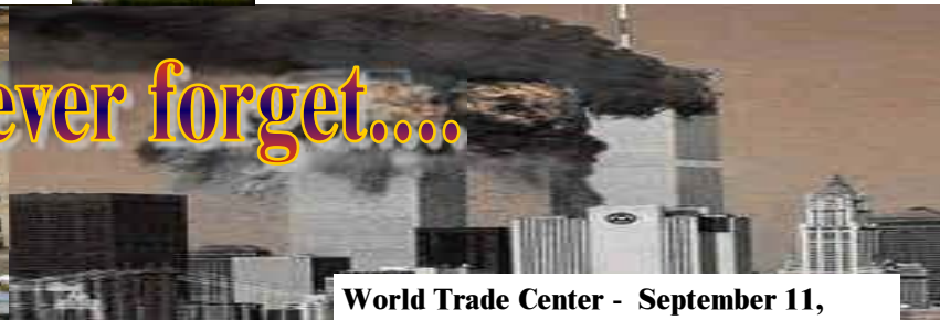
World Trade Center - September 11,