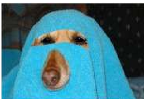
Guide dog for a Muslim woman... its called a Barka

Ever notice that you always see homeless veterans, but never homeless illegal aliens?