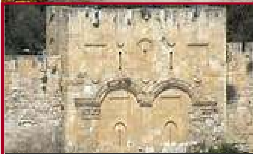
The Eastern Gate in JERUSALEM

"After this, the angel brought me back around to the Eastern Gate . Suddenly, the Glory of the GOD of Israel appeared from the east. The sound of His coming was like the roar of rushing waters, and the whole landscape shone with His Glory. I fell on my face, and the Glory of the LORD came into the Temple through the Eastern Gate. " (Ezekiel 43:1-4)