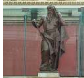
Statue of MOSES in the Library of Congress

DID YOU KNOW...every session of Congress begins with a prayer by a paid minister, whose salary has been paid by the taxpayer since 1777. DID YOU KNOW...52 of the 55 founders of the Constitution were members of churches in the colonies. DID YOU KNOW...Thomas Jefferson worried that the Courts would overstep their authority and instead of interpreting the law, would begin making law an oligarchy: the rule of few over many . How then, have we gotten to the point that everything we have done for 238 years in this Country is now suddenly unconstitutional and wrong?