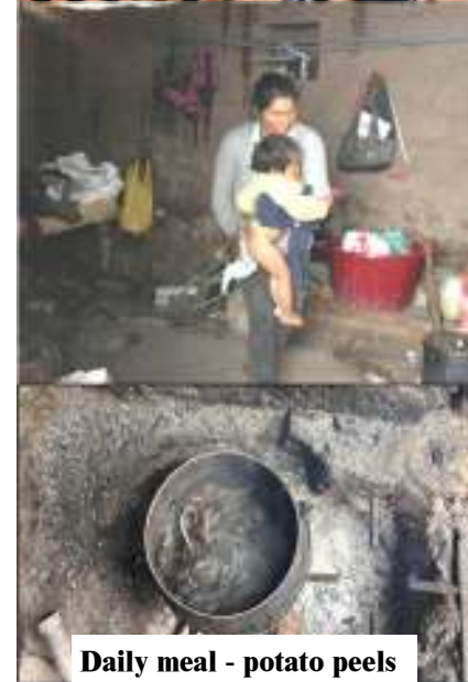
Daily meal - potato peels

There are so many reasons to celebrate, because GOD has done such miraculous things here in Peru. But there are also desperate situations in which the poor have nothing to celebrate this Christmas. Will you help us meet the needs of those with whom GOD brings us in contact?