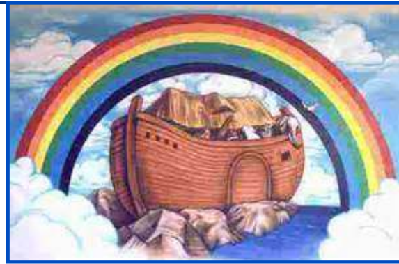
(article submitted by Cheri Scranton)

"This is the sign of the Covenant which I AM MAKING BETWEEN Me and You and every living creature that is with you, for all successive generations: I set My rainbow in the cloud, and it shall be for a sign of a Covenant between Me and the earth." (Genesis 9:12-13)