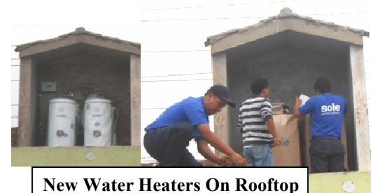
New Water Heaters On Rooftop