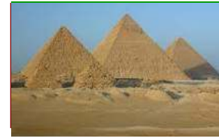
1) The Great Pyramids