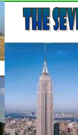
5) Empire State Building