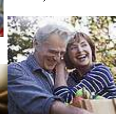
6) To Laugh