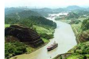
4) Panama Canal