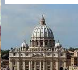
6) St. Peter's Basilica