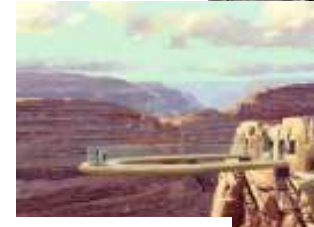
3) Grand Canyon