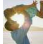
3) To Touch