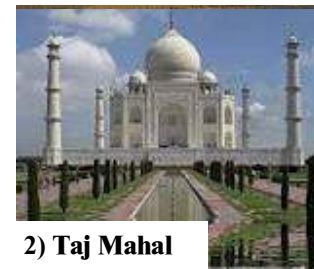
2) Taj Mahal