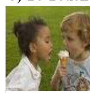
4) To Taste